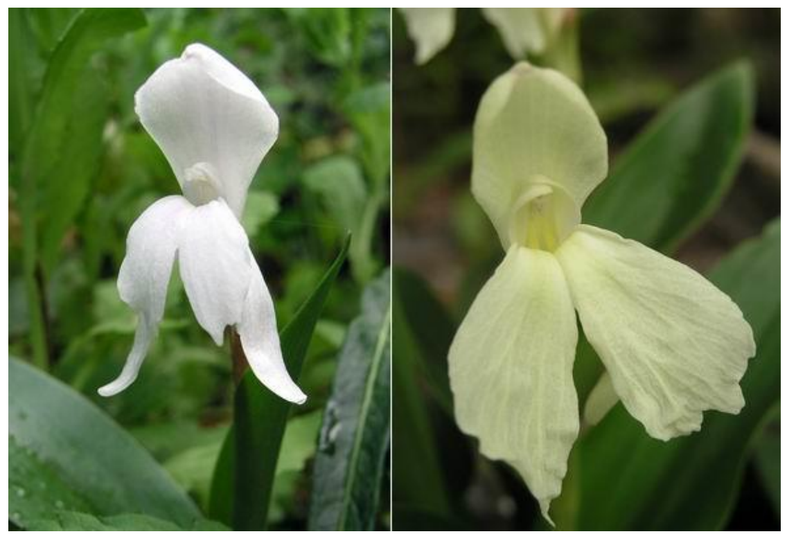
Roscoea humeana x2

Apart from shades of purple, Roscoea humeana comes in pink, white and yellow. I have still not worked out if this yellow form is true R. humeana, a hybrid with cautleyoides, or something else. If any of you can tell me I would be very pleased.