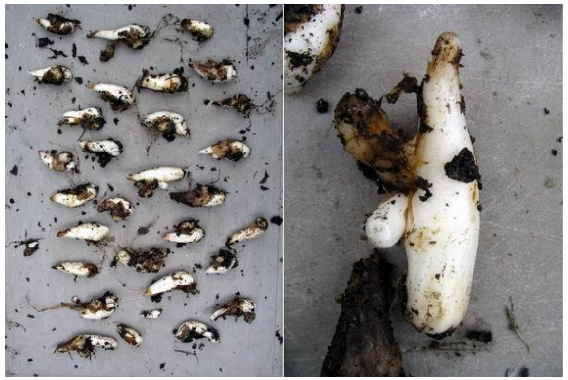
Erythronium japonicum bulbs

I have also repotted some of the Erythronium japonicum bulbs. The old bulb on these does not disappear completely but remains attached to the new bulb and after several years it forms a chain-like structure on the back of the new bulb, you can see the start of the chain on the close-up.