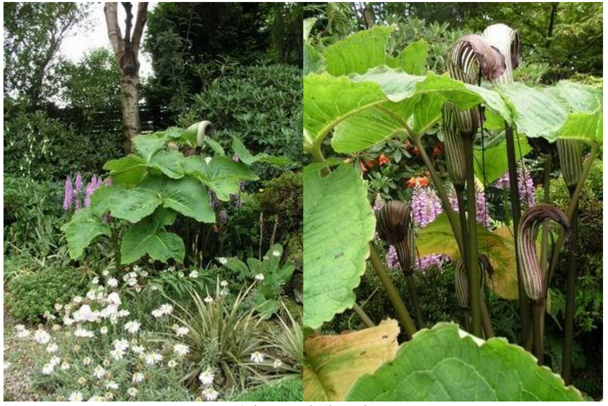
Arisaema elephas x2

I first showed you Arisaema elephas a month ago, in log 21, when the flowers were on short stems. Here it is now, still in good condition but looking very majestic at around I meter tall with the flowers just reaching through the leaves.