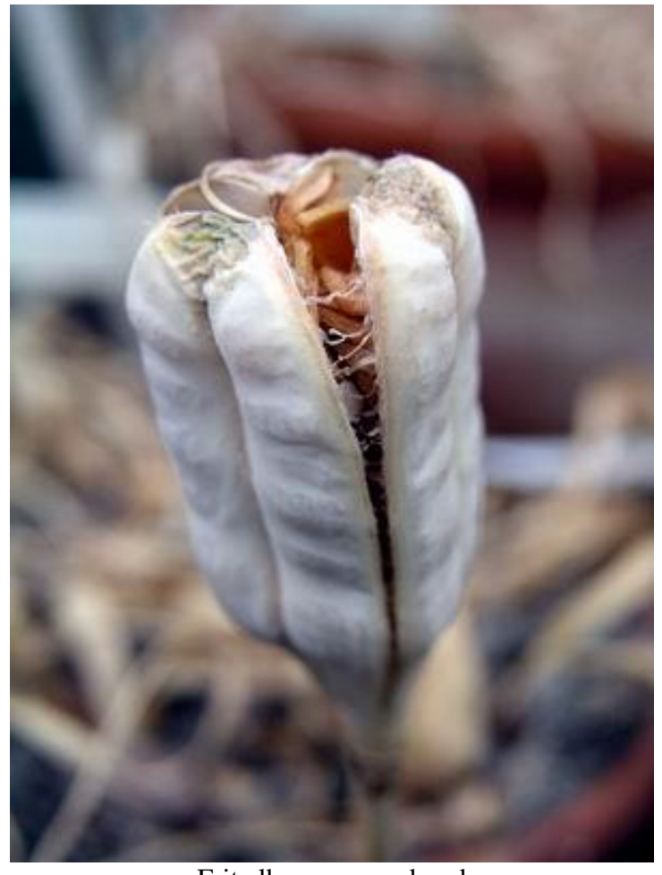
Frit alburyana seed pod

I have also repotted some of the Erythronium japonicum bulbs. The old bulb on these does not disappear completely but remains attached to the new bulb and after several years it forms a chain-like structure on the back of the new bulb, you can see the start of the chain on the close-up.