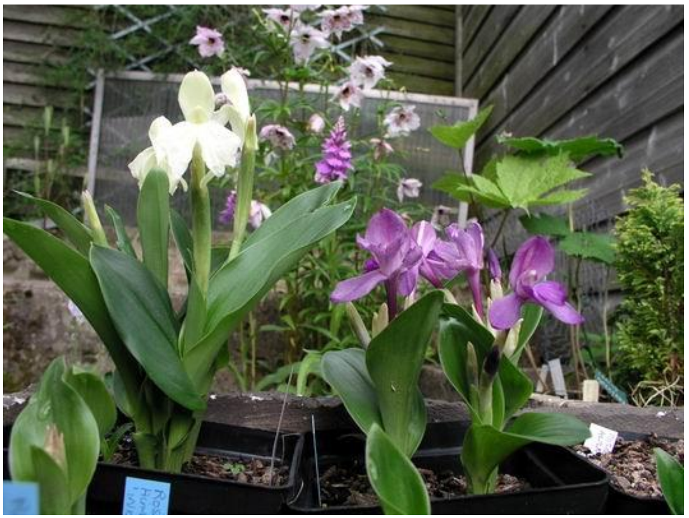
Roscoea in pots

The first of our Roscoea in pots are in flower now, they are so exotic looking that many non-gardening visitors ask if they are orchids.